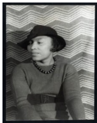
Zora Neale Hurston