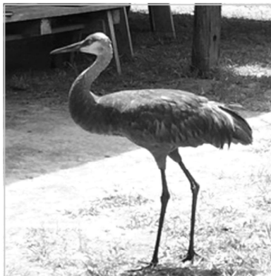
A recent visitor to the farm