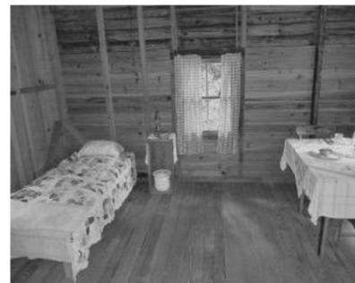
Tenant House renovations