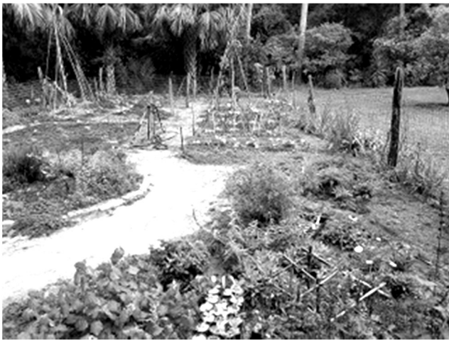
Summer Garden Sprouting Up

Be sure to visit us at marjoriekinnanrawlings.org Or floridastateparks.org/marjoriekinnanrawlings