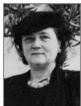
Marjorie Kinnan Rawlings