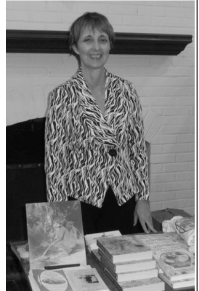
Hosting table at writers event

Again, hoping to see you at one or more of our coming events!