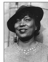
Zora Neale Hurston

Matheson History Museum 513 E University Avenue Gainesville, FL