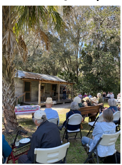
Nice turnout for the Salustri Writer's Talk