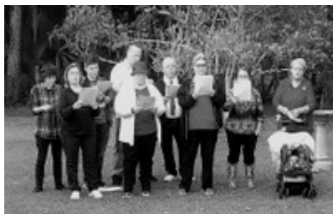
Cross Creek Baptist Church Carolers